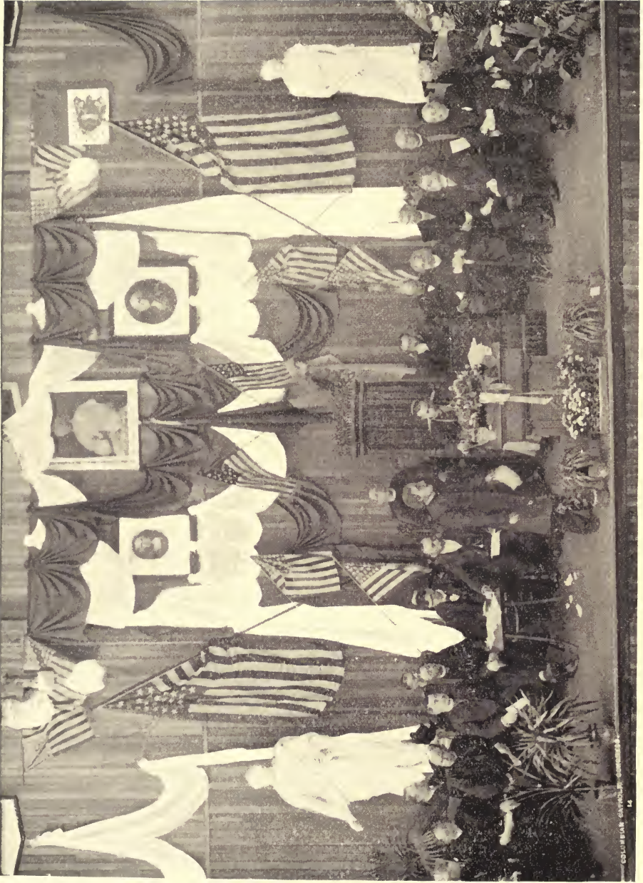
SCENE AT THE ART PALACE, CHICAGO.